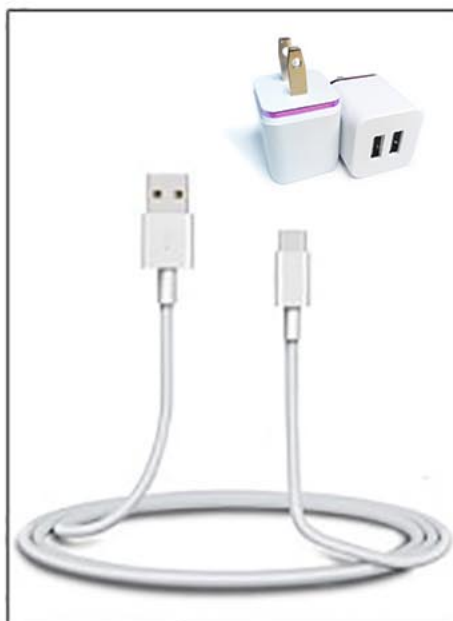
1.8m USB cable*1