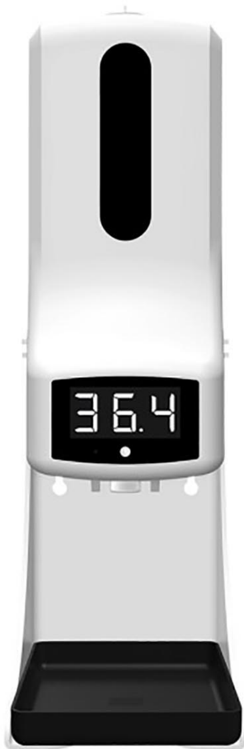
K9 Pro*1 (with Base)